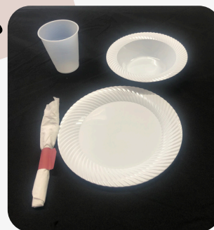
Disposable tableware included with all meals